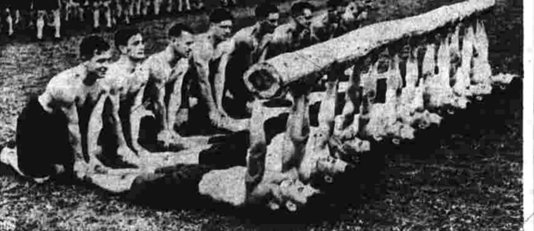
Maybe Napoleon and his modern counterpart wouldn't sneer about the "puny" race of English shopkeepers if they could see these British non-coms playing with this 200-pound gun. It's part of effort to build up Army physically to match or excel Germans.